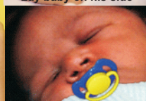
Give baby something to suck