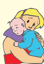
Rub or pat the baby gently between shoulders