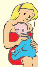
Be sure baby's head is supported