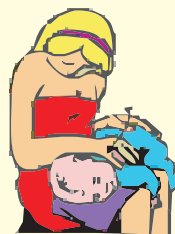
Keep baby's head on top of the leg