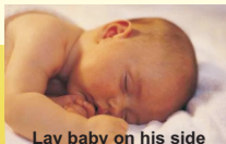
Lay baby on his side