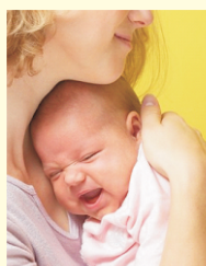
Hold & Swing baby